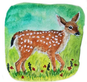
white-tailed deer fawn